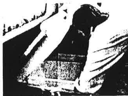
Example of Hullmaster 27 quality is the largest ice box we've seen on a 27-footer with 3-in. insulation on the cover and around the bins.

and rig are conservative. Sail area is perfectly adequate, but the aspect ratio of the main, for instance, while modern, is not extreme. The aim seems to be respectable performance all around, rather than catering to the fast beat. The aluminum mast and boom are epoxy coated and virtually maintenance free. The stays and shrouds are 3/16-in. stainless wire, and halyards are s/s wire with rope tails.